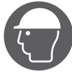
Wear Head Protection